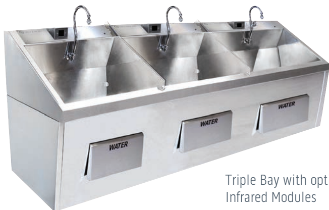
Triple Bay with optional Infrared Modules