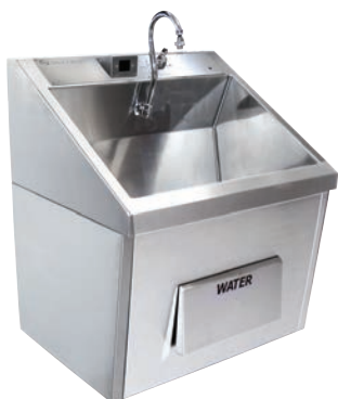
Single Bay with optional Infrared Module

Skytron's Stainless Steel Scrub Sinks provide quality, convenience and flexibility for every clinical need. Scrub Sinks are available with knee-kick and/or optional infrared module for "hands-free" operation. In addition, the optional Eye Wash (EW) feature provides a central, visible location to all staff, and saves valuable floor and wall space.