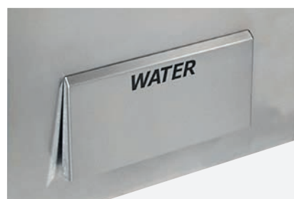
The Standard Knee Kick (-MK) panel is 16" wide and 8-1/2" high and is centered to the faucet for left or right knee operation.