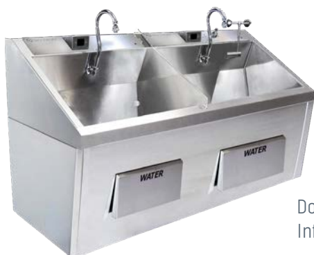
Double Bay with optional Infrared Modules and Eye Wash