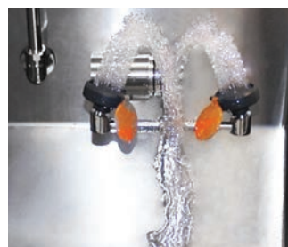
Optional Eye Wash (-EW) safety feature.