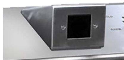
Optional Infrared Module (-IRM) conserves water usage.