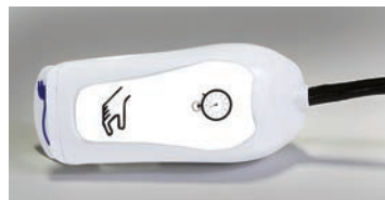
QUIKLINK (sold separately)

Skytron is the Healthcare Efficiency Specialist, providing full-room solutions of capital equipment, architectural and real-time information systems for Medical, Surgical, Sterile Processing, and Infection Prevention. Our solutions enhance the utilization of people, facilities, and capital because they are designed with the user in mind and have a low, long-term cost of ownership.