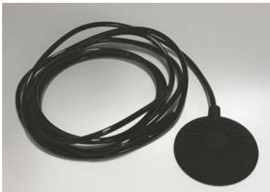
Pneumatic footswitch (included)

QUIKLINK, an automatic activation device (sold separately), can be used to remotely turn the evacuator on and off, saving filter life.