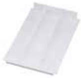
Metal Shelf Occupies 2 Cells