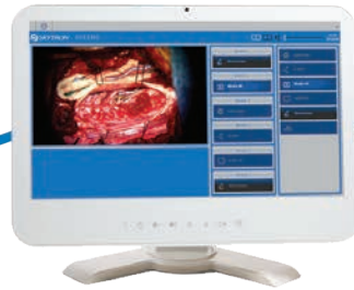
Skyvison Vendor Neutral Design Easy to Use Interface