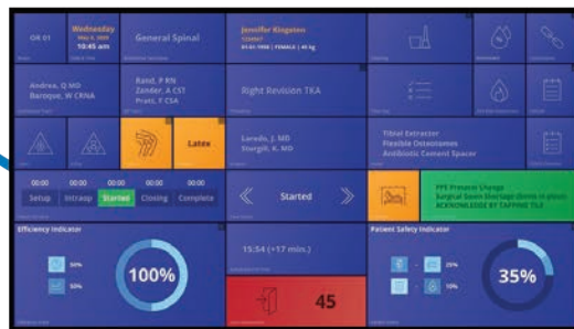
OR Cockpit Easily Access Information in Real-Time Increase Department Efficiency

Skytron is the Healthcare Efficiency Specialist, providing full-room solutions of capital equipment, architectural and real-time information systems for Medical, Surgical, Sterile Processing, and Infection Prevention. Our solutions enhance the utilization of people, facilities, and capital because they are designed with the user in mind and have a low, long-term cost of ownership.