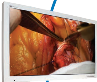
Flat Screen Displays 4K & HD Models Available Fully Flush—Hygienic Design