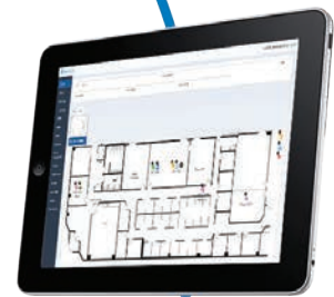
LENS RTLS Manage Assets with Ease Track Potential Infections