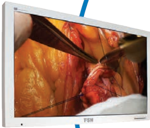
Flat Screen Displays