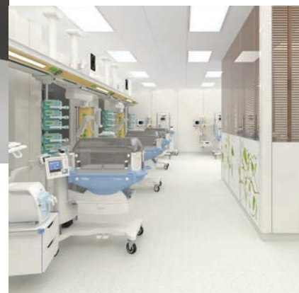
Intensive Care Units