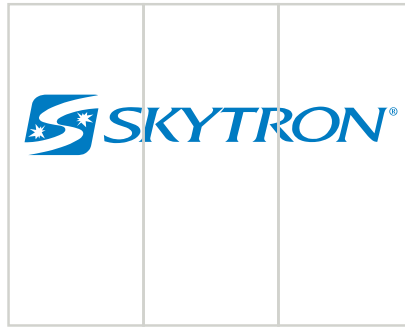
Logo Wall Panel Design