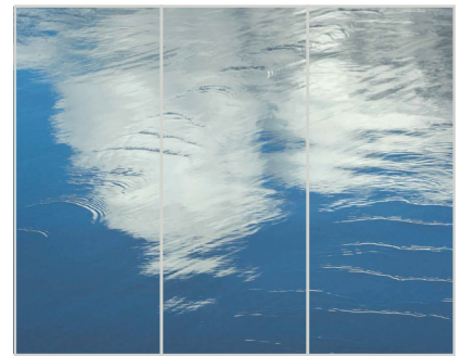
Nature Wall Panel Design