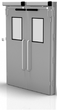
Double Symmetric Hinged