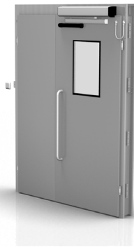
Double Asymmetric Hinged