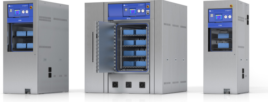
Integrity 215 & 215SG

Accommodates a wide range of trays, containers, packs, and other devices—including larger orthopedic and bariatrics sets. Capacities range from two to 16 trays, depending on model.