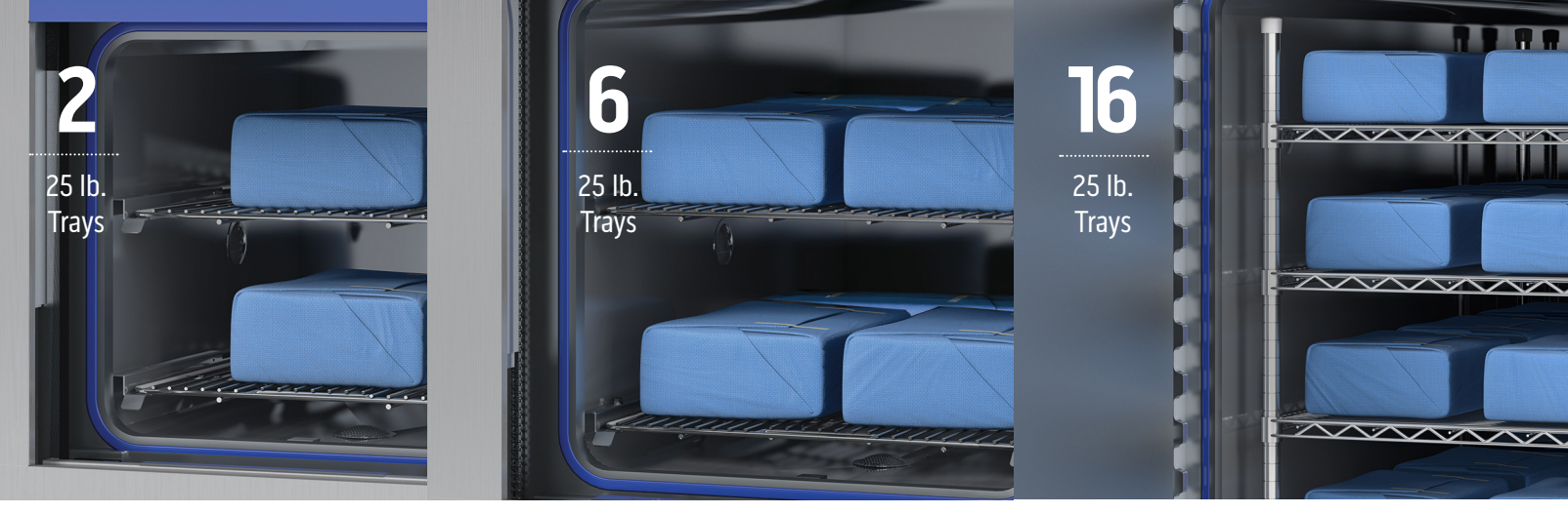
Integrity 175 and 175SG 17½" x 17½" x 26½" chamber