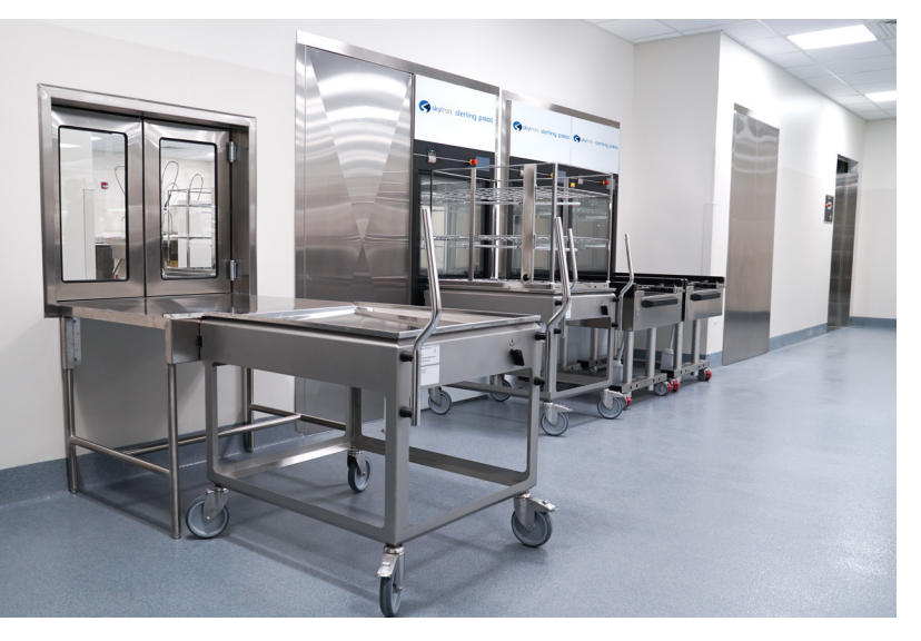
Sterile Processing Processing Sinks and Stainless Offerings Washers, Ultrasonics, and Cart Washers Prep & Pack Tables & Sterilizers