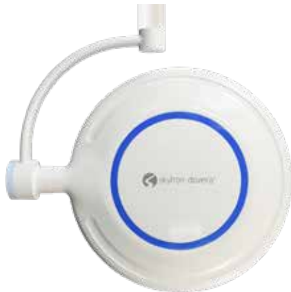
Single Yoke Configuration