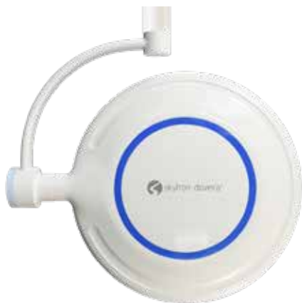
Single Yoke Configuration