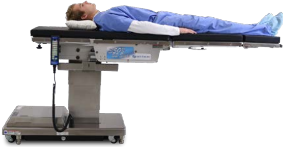
Lower Body Imaging