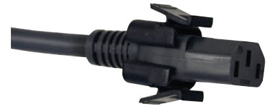
Easy to use clip style power cord