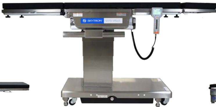
GS70 Salus The Premier Solution Smart, Safe, Simple