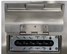
Back-up controls for emergency situations