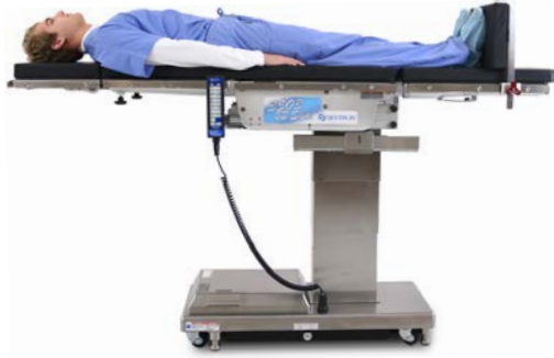
Upper Body Imaging