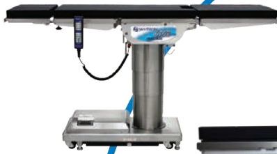
6702 Hercules Rotating Top & Removable Back