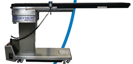
3008 Clarity Premier Imaging Table