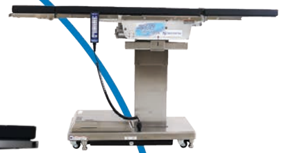
3503 EZ Slide High Performance Top Slide