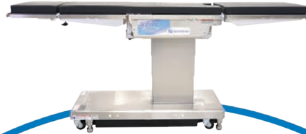
3603 Ultra Slide High Performance Removable Back 26½" Top Slide