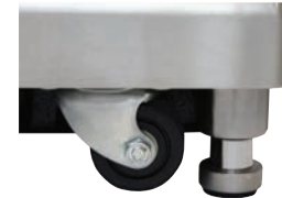
Self-leveling brakes for stability on uneven floors