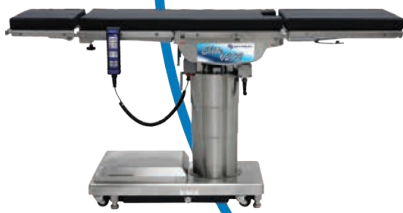
6302 Elite Rotating Top