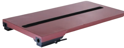
Optional 40" carbon fiber leg section for lower body imaging