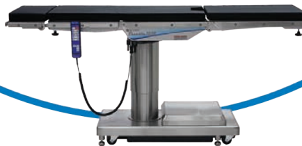
1602 Essentia General Surgery Table

Skytron is the Healthcare Efficiency Specialist, providing full-room solutions of capital equipment, architectural and real-time information systems for Medical, Surgical, Sterile Processing, and Infection Prevention. Our solutions enhance the utilization of people, facilities, and capital because they are designed with the user in mind and have a low, long-term cost of ownership.