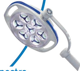
Spectra Exceptional Exam Light Excellent Shadow Reduction