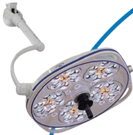
Stellar XL Crisp, Uniform Spotlighting 360° Rotation on All Axes