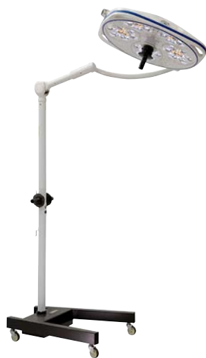
Also available on a mobile stand