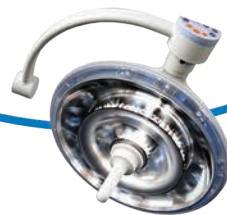
DoVera Double Reflection Technology Personalized Light Settings

Skytron is the Healthcare Efficiency Specialist, providing full-room solutions of capital equipment, architectural and real-time information systems for Medical, Surgical, Sterile Processing, and Infection Prevention. Our solutions enhance the utilization of people, facilities, and capital because they are designed with the user in mind and have a low, long-term cost of ownership.