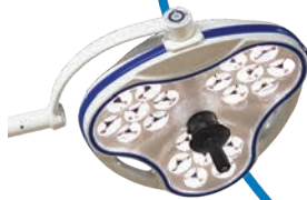
Aurora Astro Sterile Intensity Control Premier Procedure Light