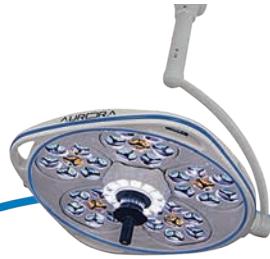
Aurora Four True Focus Adjustment Selectable Color Temperature