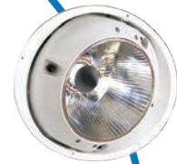
Lucina 4 LED Strobe-Guided Accuracy Fully Recessed Design