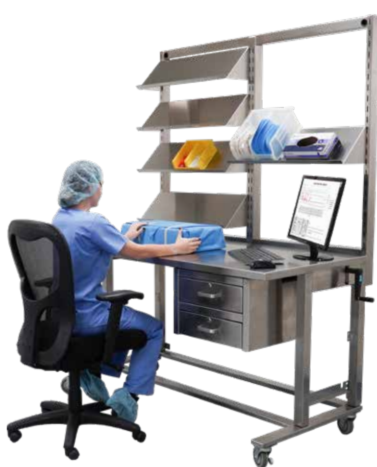
Stainless Prep & Pack Table