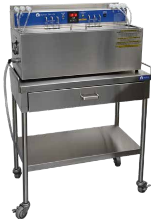
Flex CT6 Countertop Ultrasonic