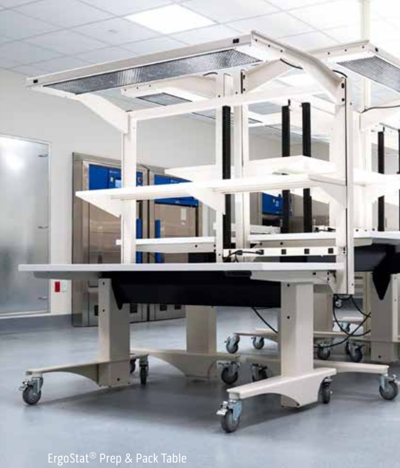
ErgoStat® Prep & Pack Table