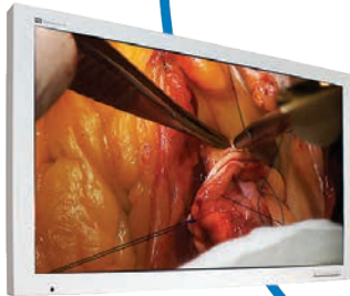
Flat Screen Displays 4K & HD Models Available Fully Flush—Hygienic Design