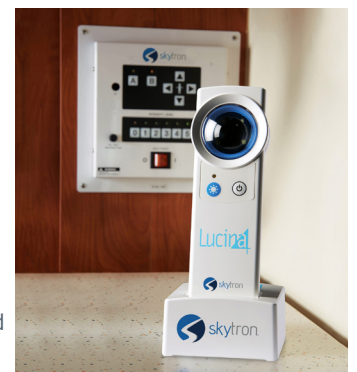
LED Strobe-Guided Positioning Wand and Wall Mounted Intensity Control