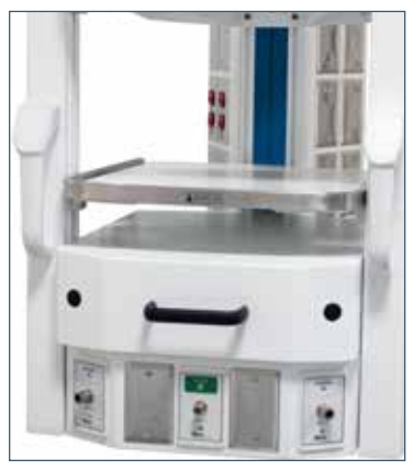
H8-300-18-A Drawer, 16 1/2" W x 19 1/2" x 6", 4" drawer height, metal, all carriers.