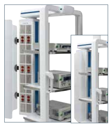
H8-300-11-A Back cover, 48" hinged.

H8-300-09-A 24" H8-300-10-A 36" H8-300-12-A 56"