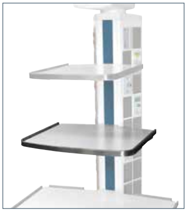
3PMSH 22" x 19" Shelf.