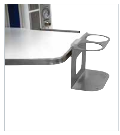
H8-300-35 Double vacuum canister holder. Holds 2 x 4 1/8" canisters.