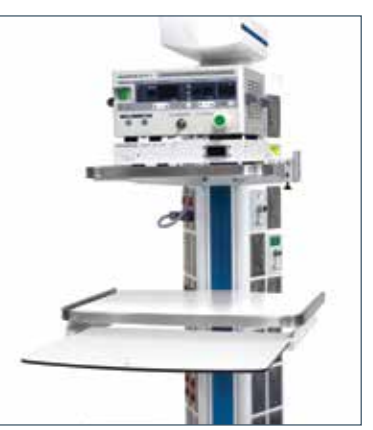
H8-300-26-A Pullout keyboard tray, 21" W extends 10", requires 22" shelf (PMSH) for mounting, mouse tray not included.