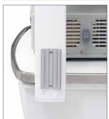
H8-300-31 Vacuum slide, bolted on boom.