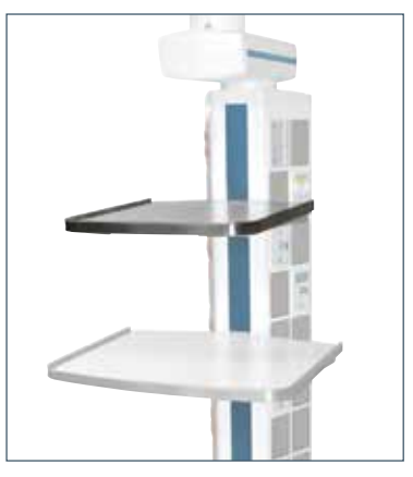
3KMSH 16 1/2" x 19" Shelf.