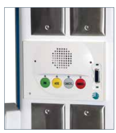
Nurse Call 1

Carrier back channel modification fit EZCare Nurse Calls 5009-9315 & 5009-9316