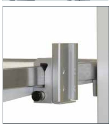
H8-200-07 Vacuum slide.