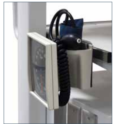
H8-200-94 Rail mounted Manometer with BP cuff holder built in.