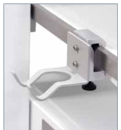
Adult resuscitation bag holder.