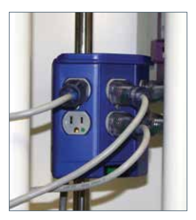
PowerMATE IV pole mounted power box w/3 duplexes. (Electrical listing does not allow international sales, including Canada.)