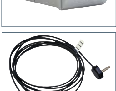
QUIK LINK AUtomatic activation device for Smoke-E-Vac system.