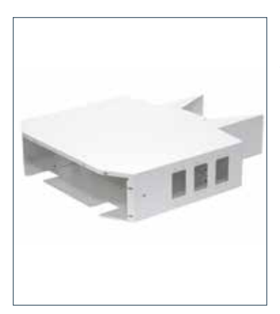
H8-300-16-A Base utility box, 16 1/2".