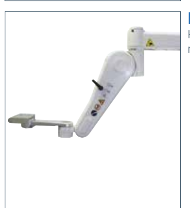
H8-011-40 Height adjustable monitor mount.