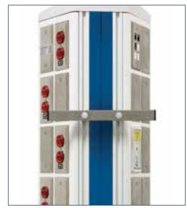
H8-300-08-A Front equipment rail, 10" horizontal, mounts in shelf track, all carriers.