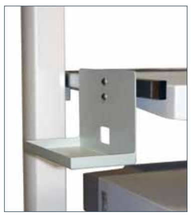
H8-201-00 Rail mounted tray for Welch Allen charger.