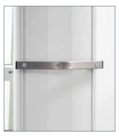
H8-300-07-A Rear equipment rail, 10" horizontal, mounts on rear of outlet channel, all carriers.