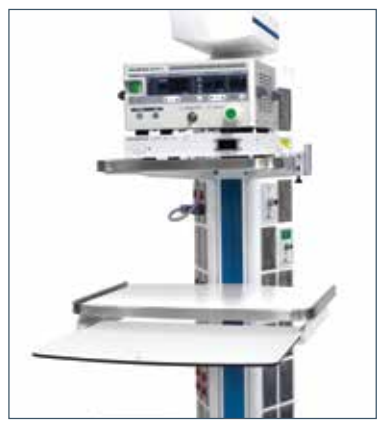
H8-300-36-A Pullout keyboard tray, 16.5" W extends 10", requires 16.5" shelf (KMSH) for mounting, mouse tray not included.