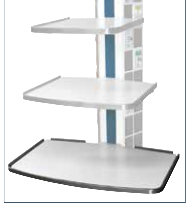
3XMSH 32" x 19" Shelf.