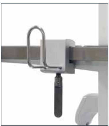
H8-200-10-A Hook for headlight.