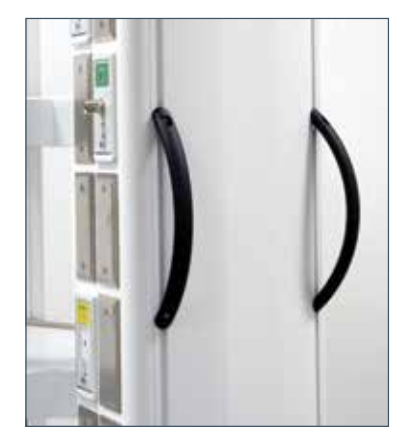
H8-300-15-A Rear handles, pair, mounts on rear of outlet channel, all carriers.