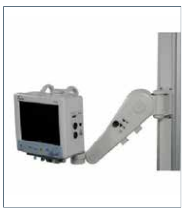
H8-011-19 Height adjustable monitor mount for Dash patient monitor model 4000. Requires (1) H8-010-51 AND (1) H8-200-01-GCX OR (1)