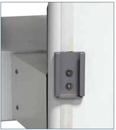
H8-300-30 Vacuum slide channel mounted on boom.