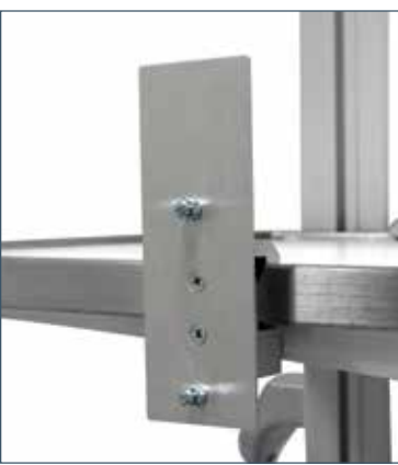
H8-200-98 Rail mounted ophthalmoscope tip holder.