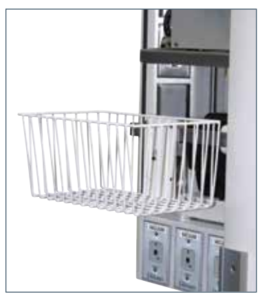
H8-200-09-A Basket 8" x 12" x 6".