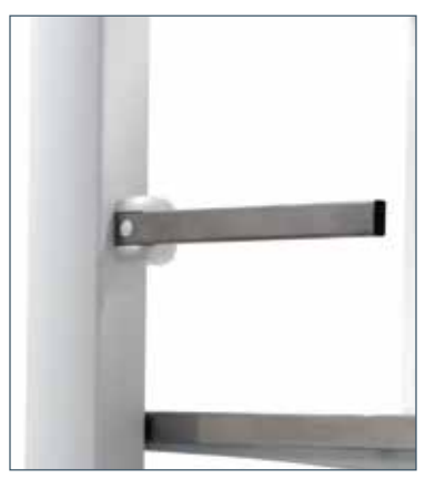
H8-200-02-A Equipment rail, 10". Compatible with KM, PM and XM only, not designed for GCX accessories.

Also shown swivel mount on rear of outlet channel, all carriers.