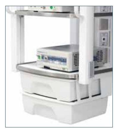
H8-300-21-A Drawer, 22" W x 19 1/2" x 14", dual 6" plastic drawers, All carriers, requires 22" shelf (PMSH) for mounting.