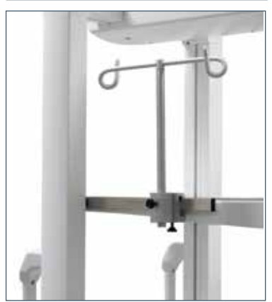
H8-200-83 IV pole, 12" with holder.