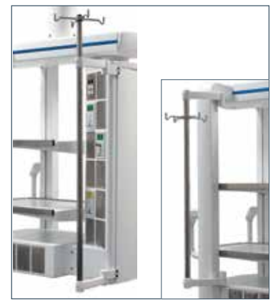
H8-300-04-A Fixed wingbar with 4 hook IV tree, swivel mount on rear of outlet channel, all carriers.

H8-300-09-A 24" H8-300-10-A 36" H8-300-12-A 56"