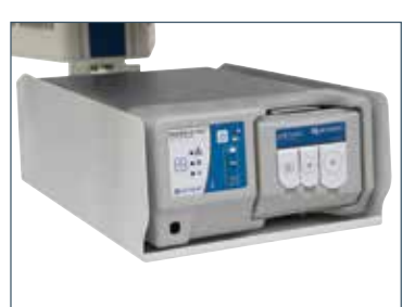
SMOKE-E-VAC Smoke evac system.