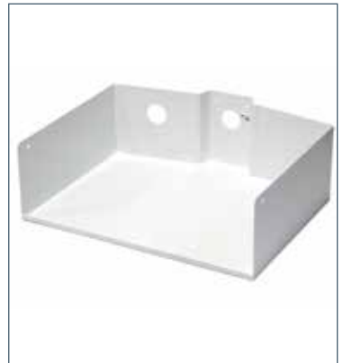
H8-300-13-A Foot pedal holder, 16.5" W CM, KM, VBM carriers, 50 lb. weight capacity.