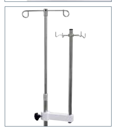
H8-200-59-A Clamp on IV pole extension, requires wingbar.