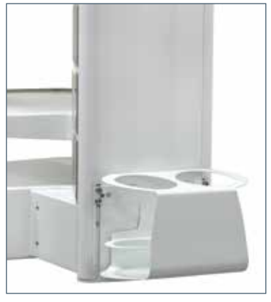
H8-300-23-A CO2 bottle holder, holds 2 E size cylinders.