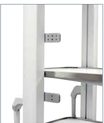
H8-200-01-GCX GCX mounting rails for front supports in 3PM, 3KM, 3XM carriers only (set, includes hardware) H8-010-51 GCX track sold separately.