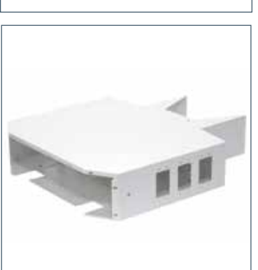
H8-300-17-A Base utility box, 22".