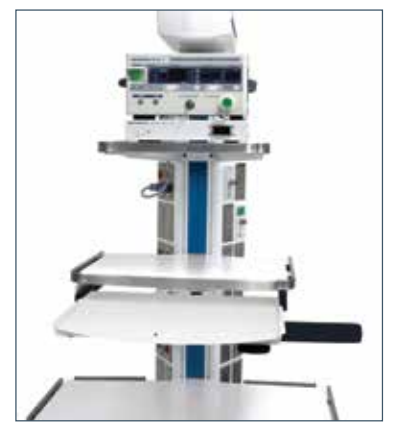
H8-300-27-A Pullout keyboard tray, 21" W extends 10", requires 22" shelf (PMSH) for mounting, includes L/R mouse tray.