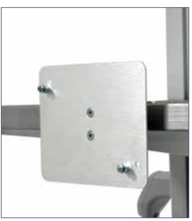
H8-200-97 Rail mounted bracket for Welch Allen SureTemp Thermometers.