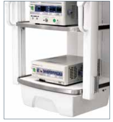
H8-300-20-A Drawer, 22" W x 19 1/2" x 7", single 6" plastic drawer, all carriers, requires 22" shelf PMSH) for mounting.