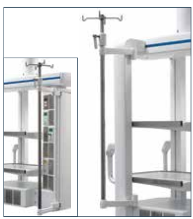
H8-300-04-E-A Extendable wingbar with 4 hook IV tree, swivel mount on front leg, all carriers.

Also shown swivel mount on front leg, all carriers