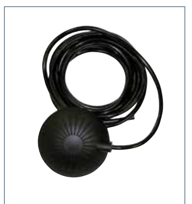
SES3 Smoke-E-Vac pneumatic foot switch.