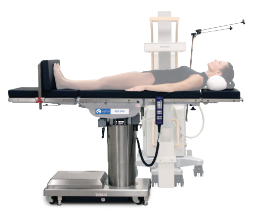
Upper Body Imaging