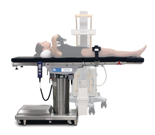
Lower Body Imaging